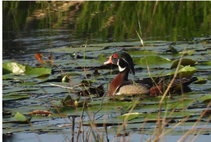
Wood Duck