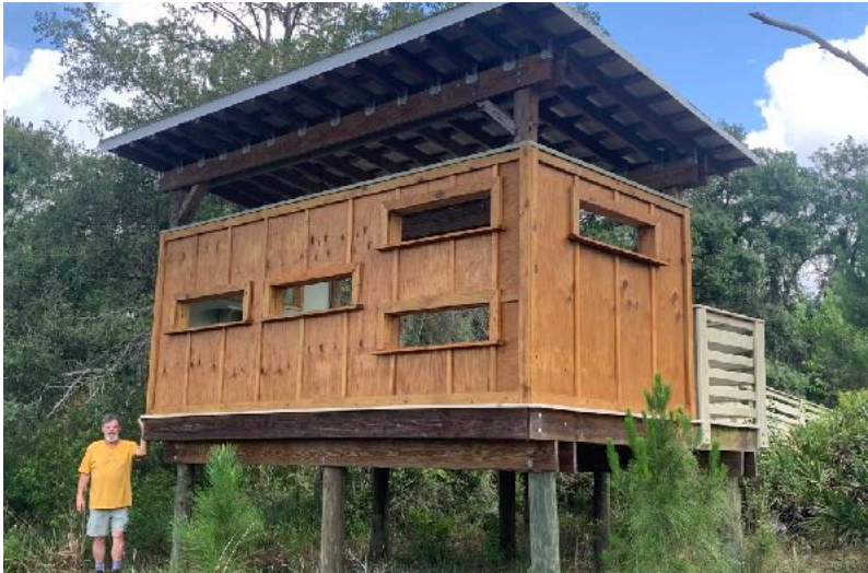
Completed Exterior with Rick