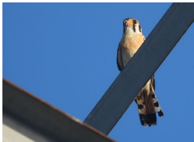
Southeastern American Kestrel on the Pinellas Trail