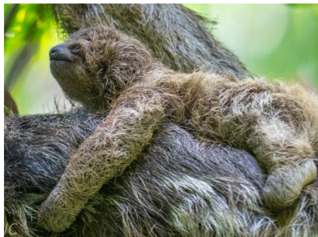
Baby Three-toed Sloth by Joe Colantonio

We began by heading to the coast, where we had a wonderful boat ride along the Tarcoles River. We had a dedicated boat that took us up and down river through a range of habitats, and we were able to move freely around the boat as we saw birds on one side or another. It was a relaxing yet exciting experience that we were all able to enjoy. Some of the avian highlights of the ride included Collared Plover, Northern Jacana, Bare-throated Tiger-Heron, Common Black Hawk, Gray Hawk, Black-headed Trogon, Turquoise-browed Motmot, Scarlet Macaw, Mangrove Swallow and Mangrove Yellow Warblers. But we saw more than birds, with American Crocodiles and Capuchin Monkeys also making an appearance.