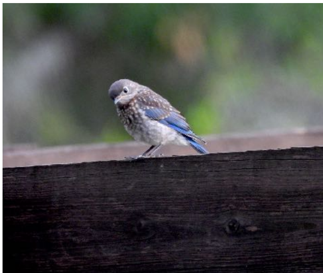
Eastern Bluebird Fledge at Starkey Park

The female Eastern Bluebird at W.H. Jack Mitchell Jr. Park box #2 laid a second brood of white eggs. Laying white eggs is a recessive genetic trait for Eastern Bluebirds and a female must inherit the recessive gene from both parents to lay white eggs. Only 3% of Eastern Bluebird females lay white eggs.