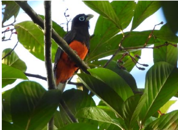
Baird's Trogon