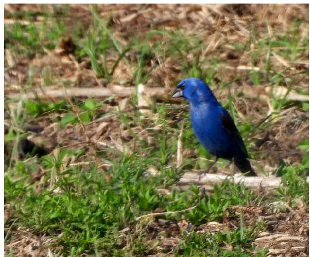
Blue Grosbeak