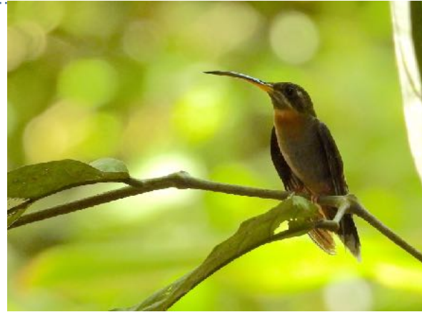
Band-tailed Barbthroat