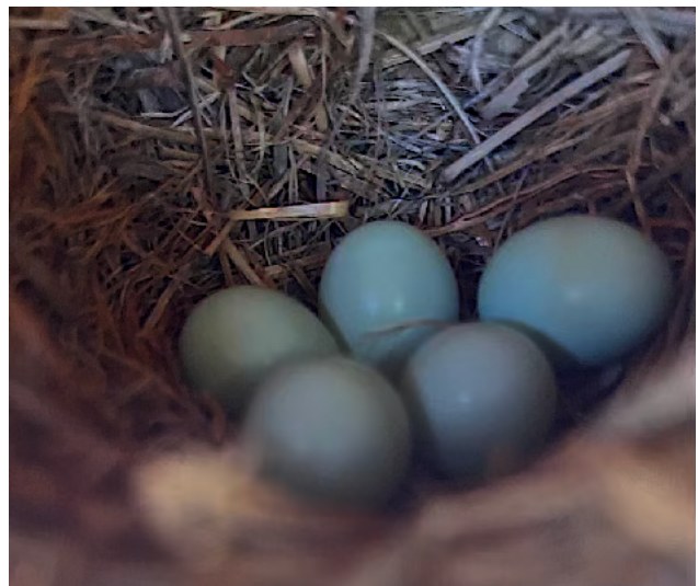
Eggs in Heartwood Box 2