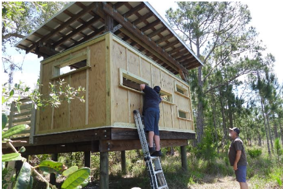
Exterior Work in Progress