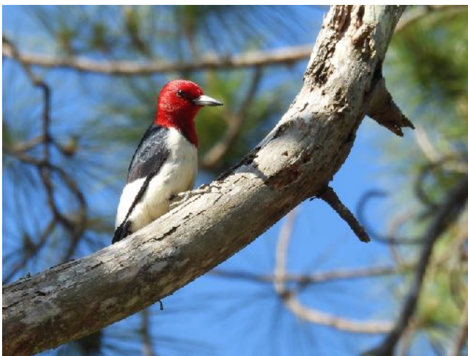
Red-headed Woodpecker

Our final stop for the morning was on Clay Hill Road, where we were lucky enough to find another male Blue Grosbeak, a pair of Summer Tanagers, and brief views of a Great Crested Flycatcher and Eastern Towhee. This trip would more accurately have been titled a rural trip along the border of Pasco and Hernando counties. The area is changing, but through this annual trip we bear witness to that change. A striking absence from our list was the non-migratory Southeastern American Kestrel - common here in springs past.