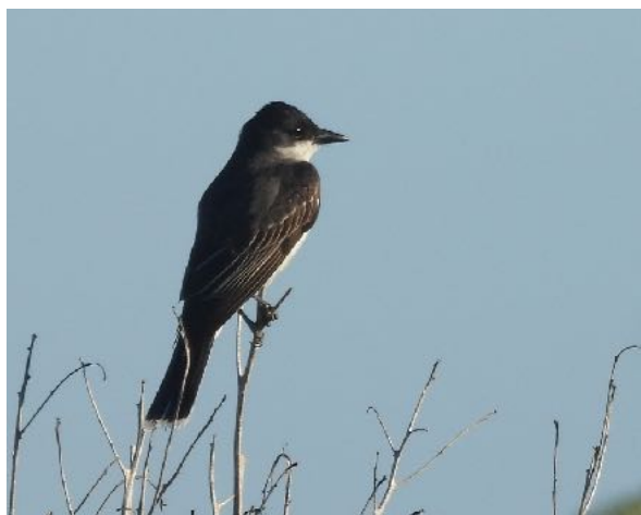
Eastern Kingbird on the Pinellas Trail